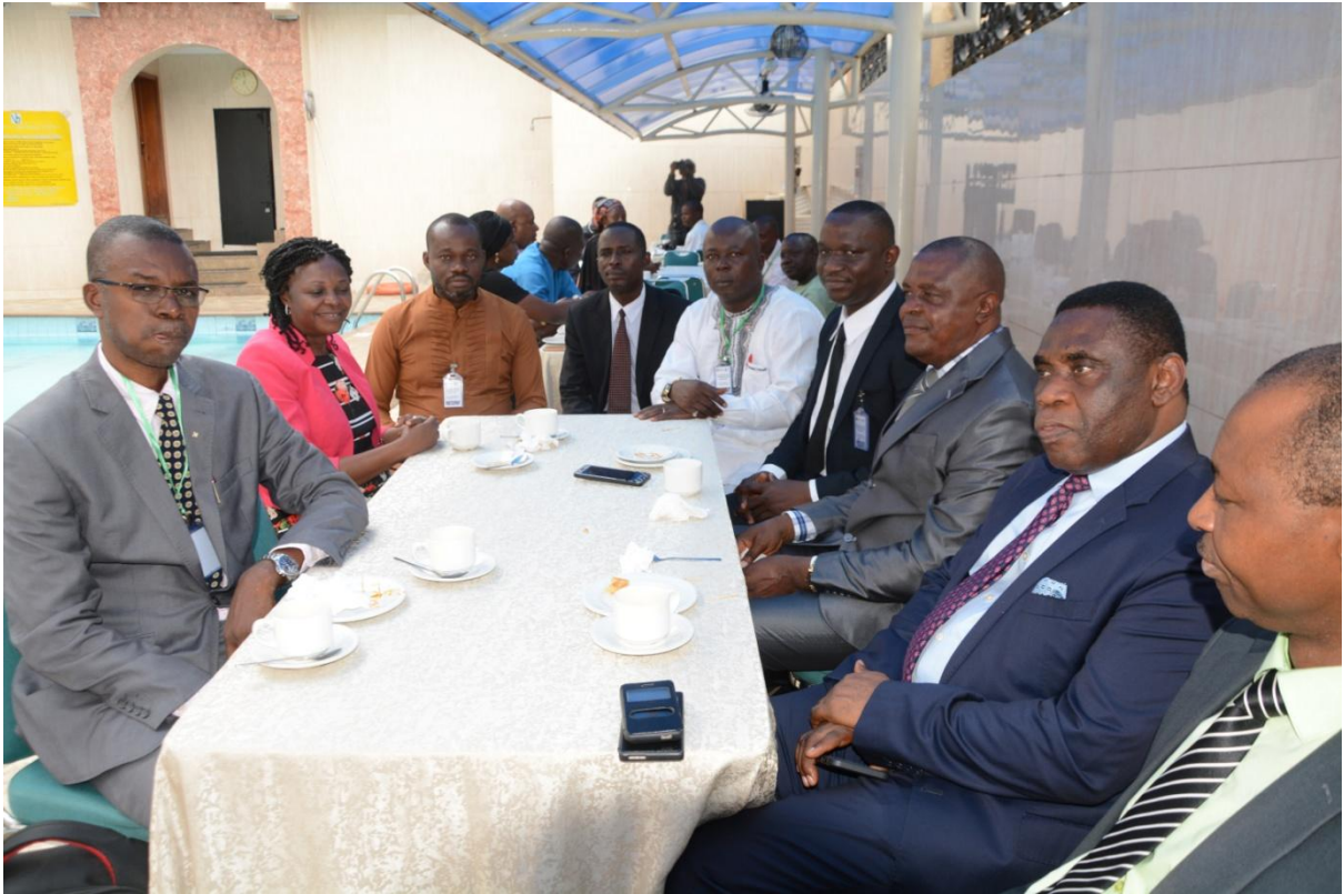
Participants at a break session