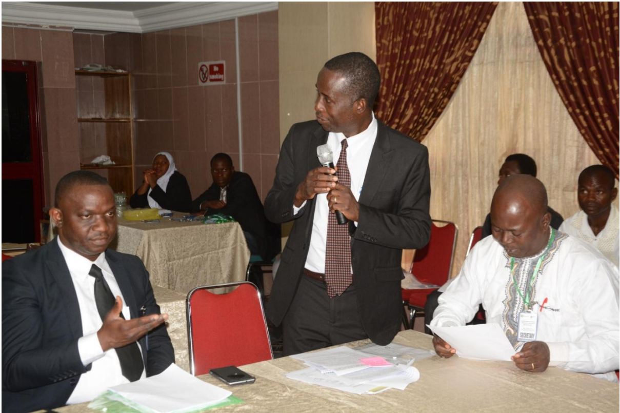
Key Note Speaker responding to Questions