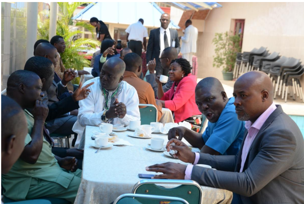
Breakfast time for all participants