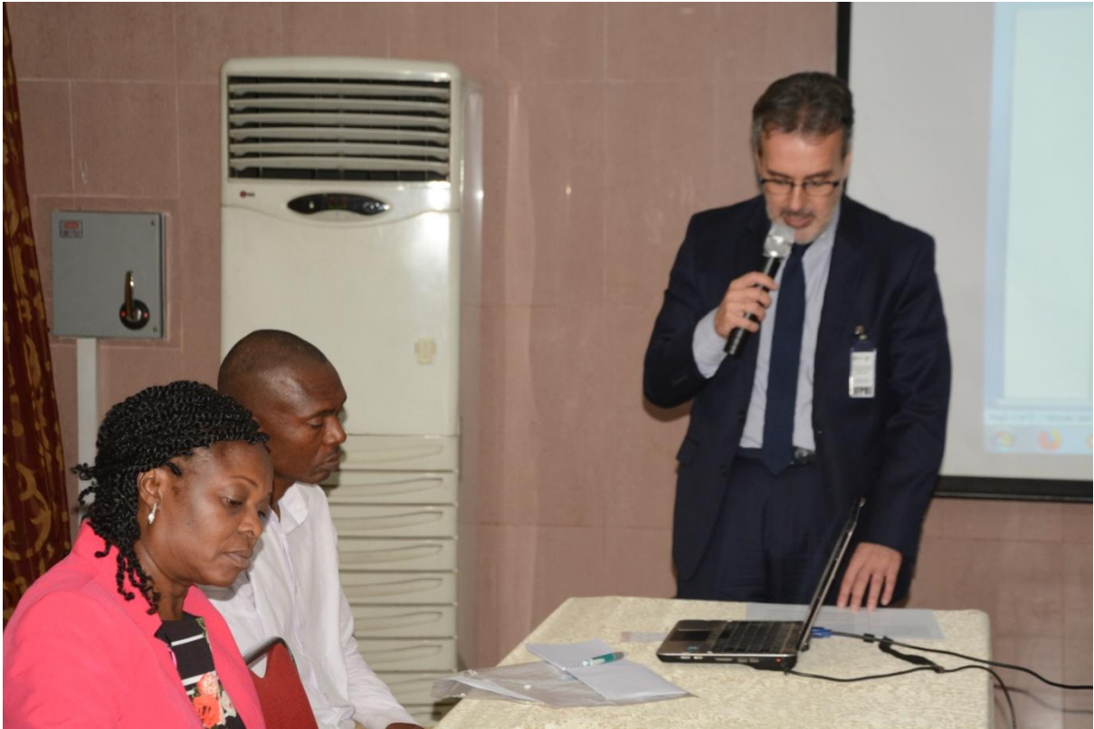
International Food Policy Research Institute (IFPRI-Nigeria) Country Leader Presenting his speech at the event