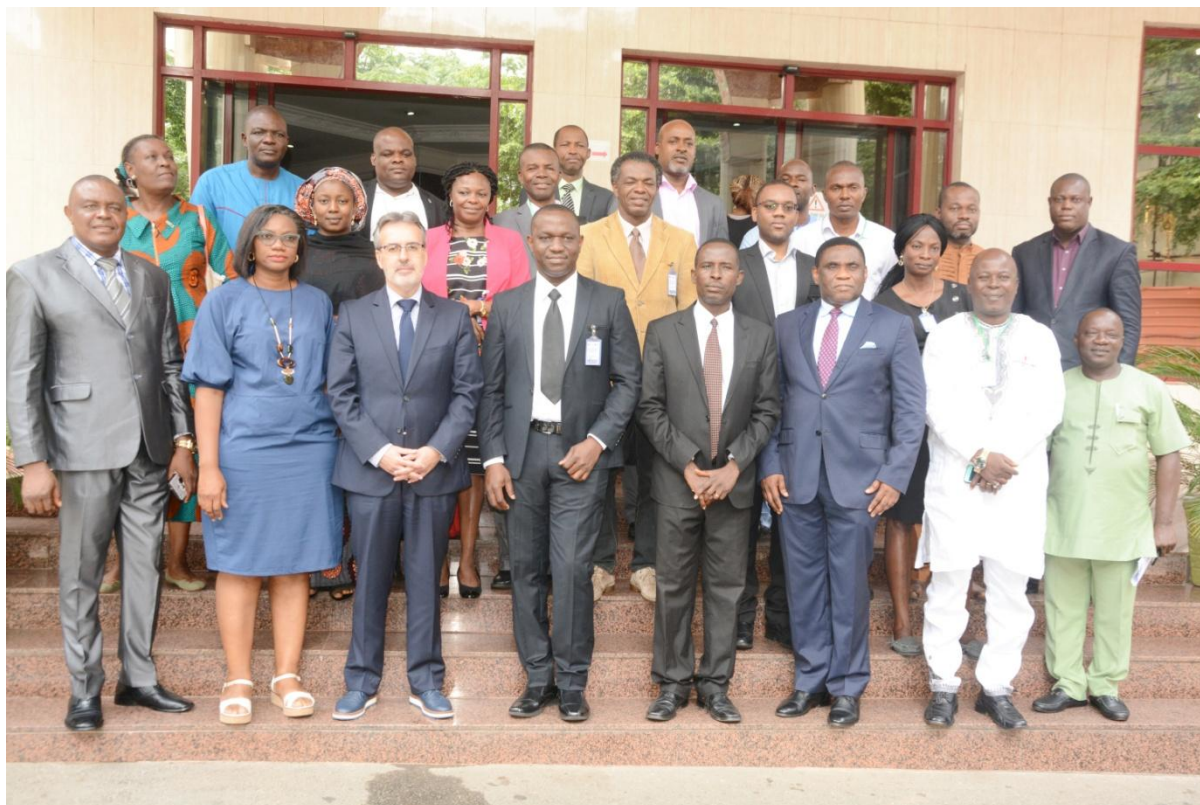
Group Photograph of some participants at the event