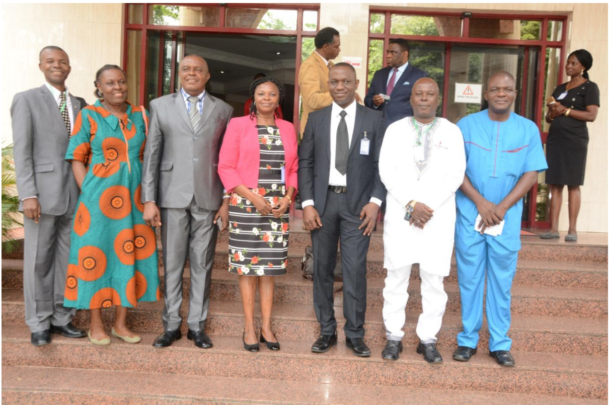
APRNet EXECUTIVE COUNCIL