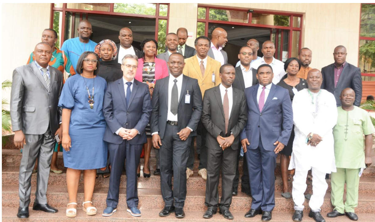
Figure 2: Group Photograph of some participants present at the 5th APRNet National Multi-Stakeholders' Forum on Making Agricultural Research Work for End Users in Nigeria

On Thursday, 30th August 2018, APRNet held an 1-day 5th APRNet National Multi-Stakeholders' Forum on: "Making Agricultural Policy Research Work for End-Users" at Valencia Hotels, Wuse II, Abuja. The one-day APRNet 5th National Multi-Stakeholders Forum recognized the efforts of the present administration led by President Muhammadu Buhari towards diversifying the economy of Nigeria through sustained agricultural transformation.